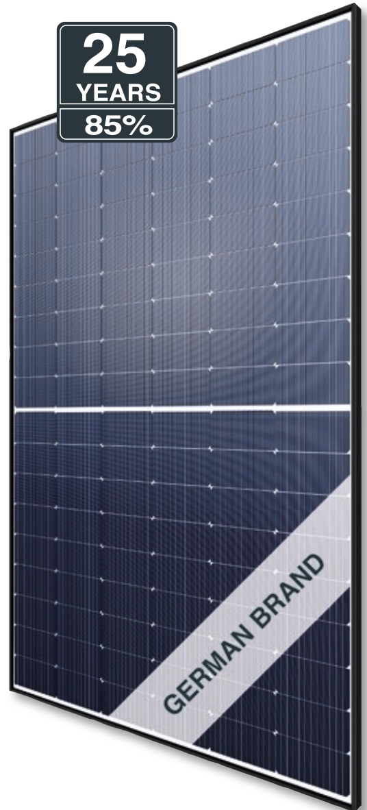
Fig. similar 108MHEN20530A

Exclusive linear AXITEC high performance guarantee!