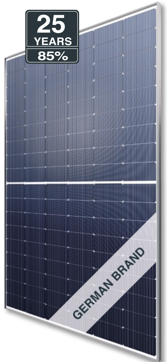
Fig. similar 108MHEN210225A

Exclusive linear AXITEC high performance guarantee!