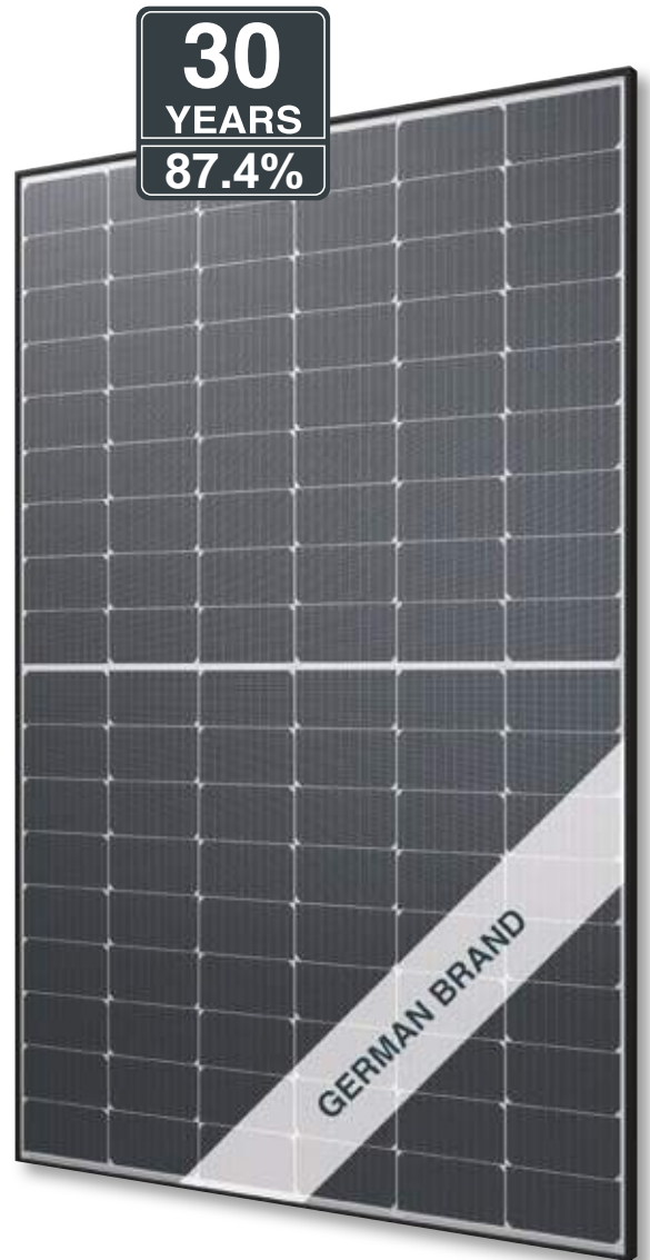
Fig. similar 08TFMEN231004A-56/1